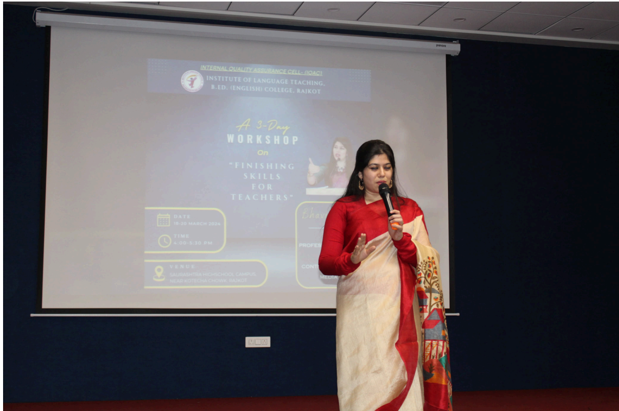
Bhavisha Madam 18/3/2024 till 20/3/2024