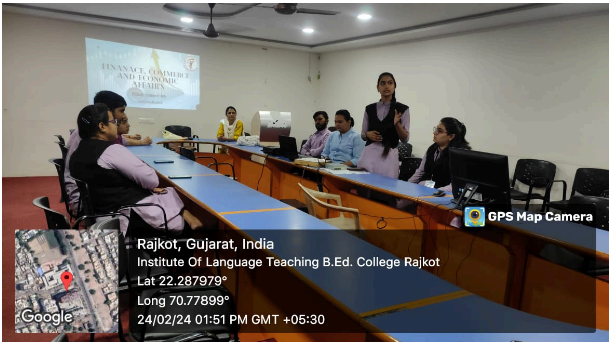
Youth parliament programme Debate competition