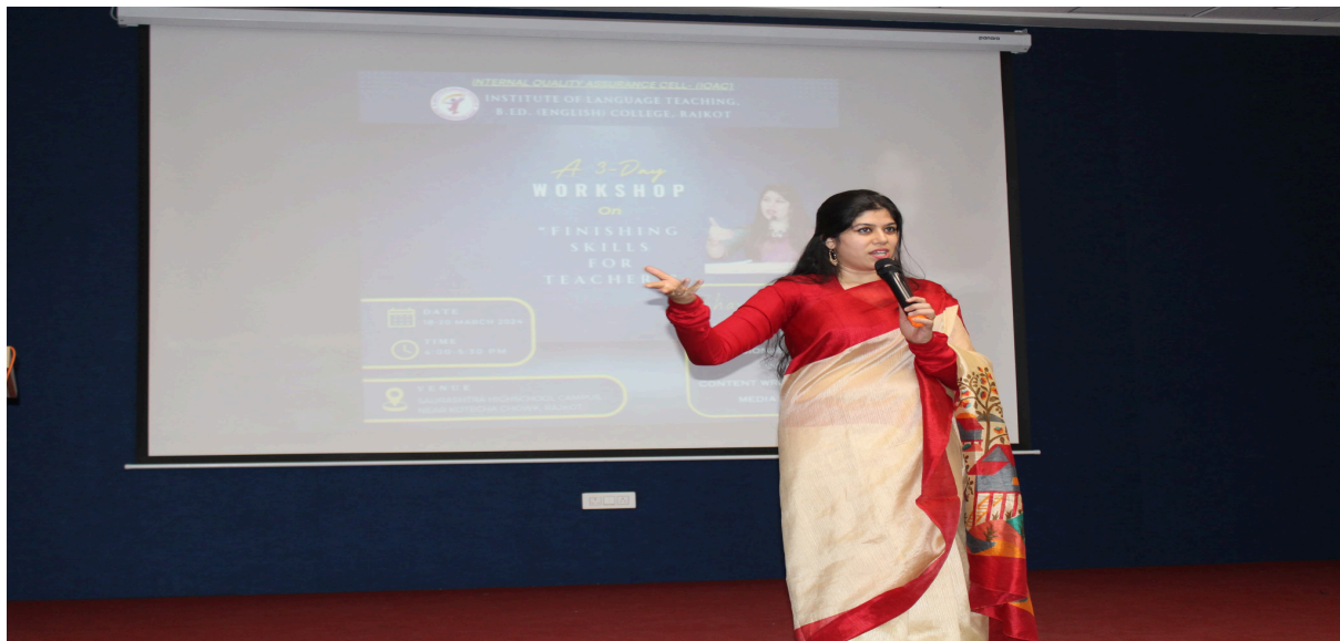
18/3/2024 to 20/3/2024