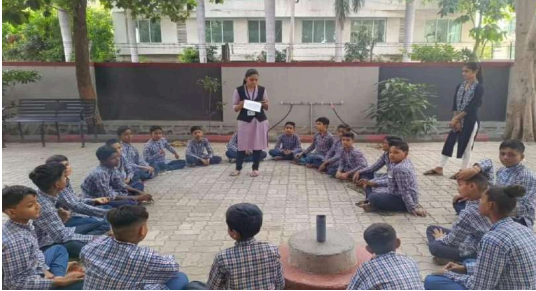
Students in Evaluation of practice teaching and demonstration as alumni